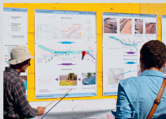
Training of local experts

Since the 1960s local snow avalanche experts have been trained in the mountainous regions of Switzerland to deal with avalanche situations on site. They are trained to communicate national and regional warnings at a local level, to evaluate hazard/risk situations on-site and to provide their experience to the local risk and emergency management authority (e.g. for temporal closure of roads, artificial avalanche release and general risk management support). These local avalanche experts were such a success that following the major flooding in 2005 it was decided to extend the “local experts” approach to other natural hazards, especially floods. Since then, local natural hazard experts have been trained by the cantons to serve the municipal authorities or communities. In case of an event, they are able to interpret hazard and risk information in the local context. All receive the same basic training which is then adapted to the local conditions.