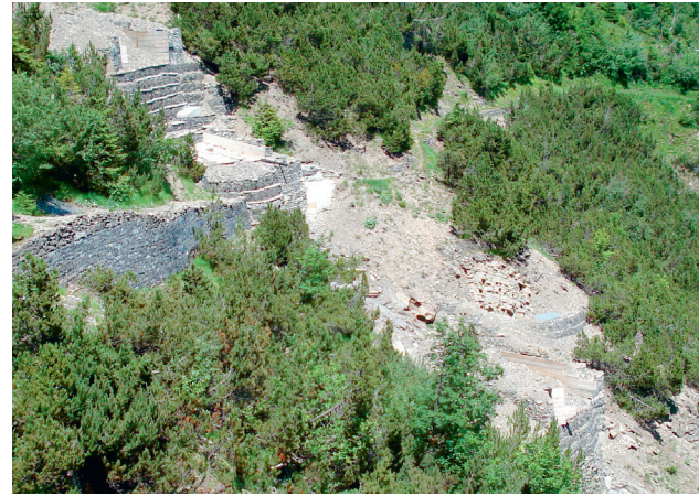
Watershed management using reforestation and slope stabilization (gabion)

Insurers are an important private sector partner for DRR. Insurers and the public sector agreed on ten key working areas with corresponding joint projects, ranging from the geographical information systems (GIS) Hazard platform to risk based design level for protective works. The cooperation between private and public sectors can contribute to filling critical gaps and to substantially reducing risk.